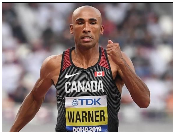
At the break in Doha Canadian Damian Warner (above) held a slim lead over teammate Pierce LePage, defending champ Kevin Mayer and Lindon Victor of the Santa Barbara Track Club.