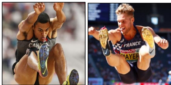
Canadian Pierce LePage (left) and defending champ Kevin Mayer/FRA (right) were big news in the long jump.