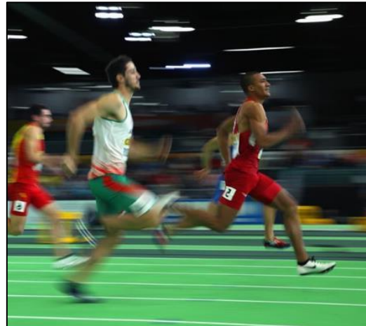
Ashton Eaton rushed to a first day lead at the 2016 World Indoor heptathlon. He sprinted to a 6.81 60m clocking.