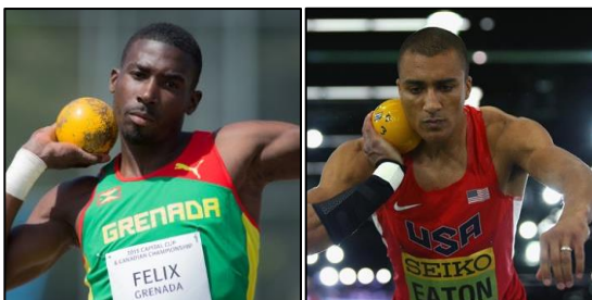
The shot put gave a boost to Kurt Felix (left) who won at 15.02m/49-3½. Ashton Eaton (right) managed 14.16m/46-5½ in round #3.