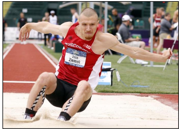
Double Z's long jump covered 7.69m/25-2¼ of Sacramento city real estate.

Jumping in side-by side pits on the east side of the stadium Hardee opened with speedy 7.43m/24-4½ and immediately passed his two remaining attempt. The goal here was