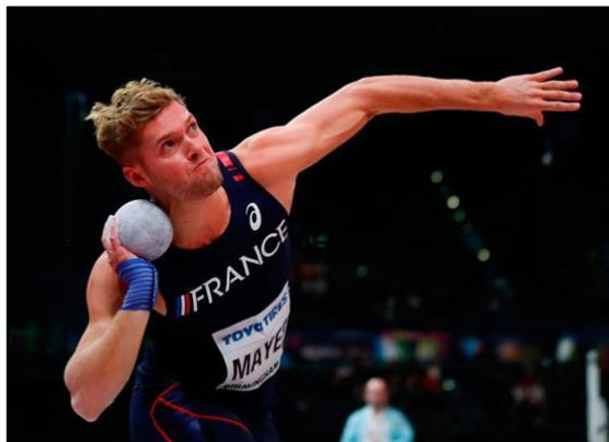
26 year old Kevin Mayer of France, just held on in Birmingham, UK to add the IAAF indoor title to his 2017 outdoor crown. His margin of victory over Canada's Damian Warner was a scant 5 points.