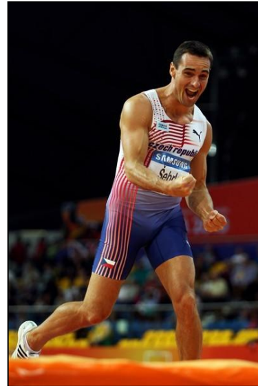
The happiest guy in the high jump house was the ageless (35 years old) Roman Sebrle/ CZE who cleared 2.09m/6-10¼. The Doha affair represents his 16 th Olympic or World combined events championships. 16!