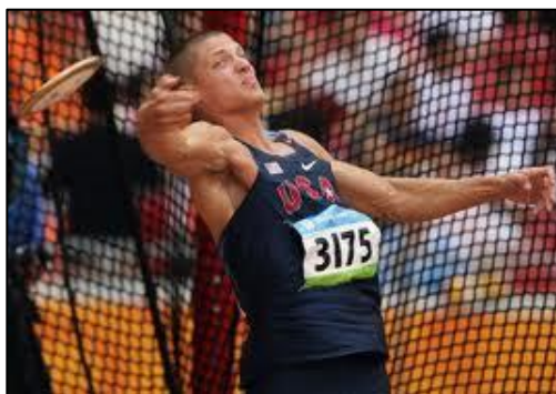
Trey Hardee pumped a decathlon PR 49.89m/163-8 to regain the overall lead from Ashton Eaton who also tossed a deca PR. 46.17m/151-6. Yow!

Drozdov then coolly stepped to the circle and won the event lead with a 50.29 m/164-11 toss.