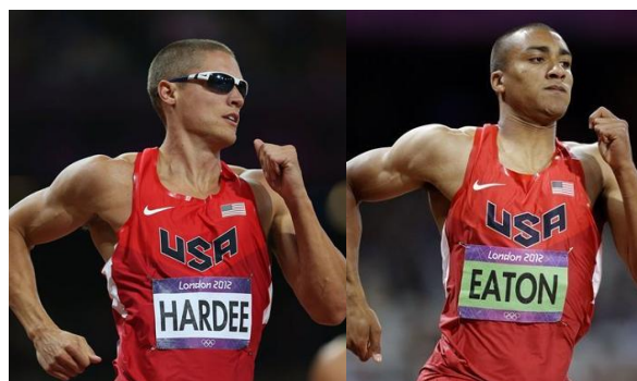
Trey Hardee (left) and Ashton Eaton (right) raced to the silver and gold medals in London.

Hello Again...WOW. For the 5 th time in modern Olympic history Americans took the top two places in the Olympic decathlon. Twice Americans swept (1936, 1952) and on two other occasions Uncle Sam's charges took the top two spots (1924, 1956). Over the past two days Ashton Eaton and Trey Hardee, the world record holder and world champion respectively, completely dominated a 31 man field. This is the final newsletter covering the 23rd Olympic Games decathlon from London.