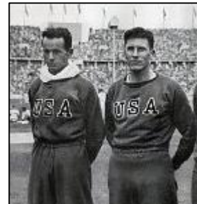
Bob Clark (silver) and Glenn Morris (gold)