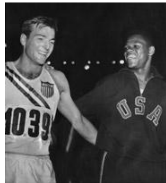
Bob Mathias (gold) and Milt Campbell (silver)