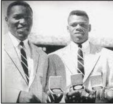
Rafer Johnson (silver) and Milt Campbell (gold)