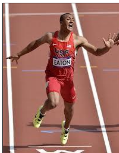
Ashton Eaton won the first two events in London with a meet record in the 100m (10.35) and just missed another with an 8.03m/26-4¼ long jump.