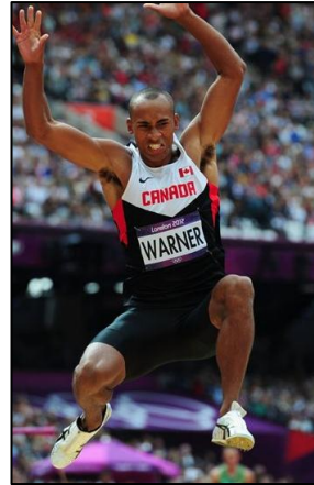
Canada's Damian Warner (left) was one of the few who PR's in the long jump, here 7.54m/24-9. He ended the morning session in 5 th place.

The sun (remember him?) made an appearance during the shot which started 21 minutes late, and confusion reigned during the first round. Ashton Eaton's initial toss of 14.55m/47-9 was displayed as 15.48m/50-9½ on the scoreboard, (don't we wish), a mark achieved by the previous thrower, Hans van Alphen. Eaton was followed by Karpov who then won the event at 16.47m/54-½.