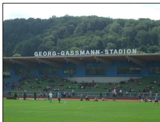
At 11:00 am there were already several hundred zehnkampf fans already at the Marburg city stadium.

At noon on Saturday, June 21, 2012, exactly 100 years and 6 days after Jim Thorpe captured the very first Olympic decathlon contest in Stockholm, America's decathlon