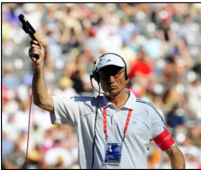
It was difficult to beat the WC starter who averaged 0.6 seconds from 'set-to-gun' for five 100m races.

Section three was the fastest seeded race with Yanks Trey Hardee, with right knee taped, in lane 5 and Ashton Eaton in 2. 21 year old Yordani Garcia/CUB was on the