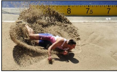
Defending champ Roman Sebrle, 34, looked like his old self in the long jump, getting a noteworthy 7.80m/25-7 1/4.

Krauchanka opened at 7.62m/25-0 and Hardee responded with a PR 7.80m/25-7 1/4 getting only 2 inches of the toe-board but running tall and off the board (wind -0.9 mps). Fast improving Oleksiy Kasyanov/UKR also leaped 7.80m/25-7 1/4, Roman Sebrle opened eyes with a 7.72m/25-4 pop and Cuba's Yunior Diaz managed 7.72m/25-4, all in round #1. This was terrific jumping as 5 exceeded 25 feet in the first round alone.