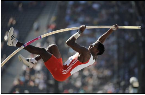
Olympic bronze medalist from Beijing, 21 year old Leonel Suarez/CUB, managed a pair of vault PRs ultimately settling for 5.00m/16-4¾.

At 6:30 pm, as the decathlon vault went into its 5 th hour, there were 9 vaulters remaining (3 in "B", 6 in "A").