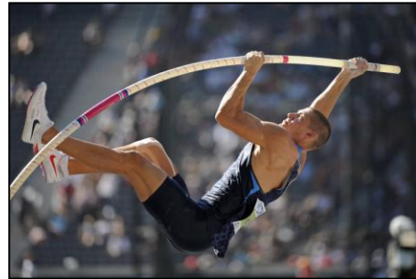
Trey Hardee did not have a vault miss until he got to 5.30m/17-4½. He won the event at one bar lower.

fired off a 75.02m/246-1 breaking Bryan's Clay's 2001 meet record (72.00m/236-3) but, more importantly, keeping his hopes alive for a Swedish national record, something planned since Götzis. He passed his final two attempts. Of the prominent medal contenders, the 20 year old Garcia fired off a 69.37m/227-7, a ten inch PR, and Sebrle improved in round #3 to 65.61m/215-3.