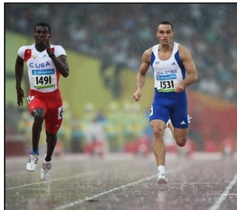
Cuban Leonel Suarez wins the first sprint section over defending decathlon champ Roman Sebrle/CZE (r).