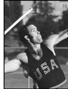
BILL TOOMEY 1967 – Winnipeg