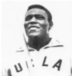
RAFER JOHNSON 1955-Mexico City