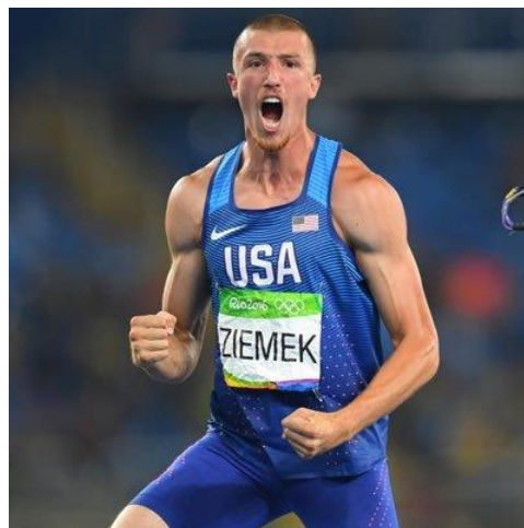
Zach Ziemek's 2nd day was an improvement over his first until the 1500m.