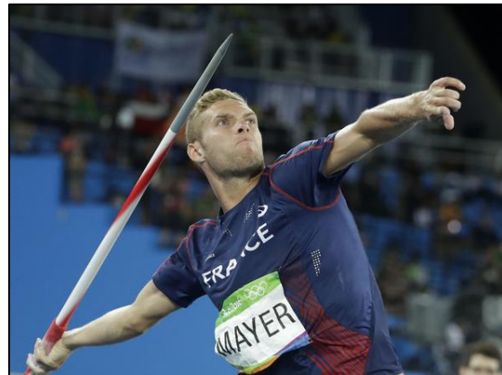
France's Kevin Mayer became the first non-American, non-Czech to win an IAAF world title since 1987.