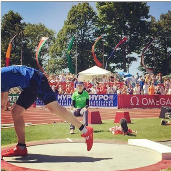
Crowds surrounded both throwing circles.

After Two: Warn 2033, LePa 1947,, Sint 1921, Kasy 1904.....13th Tonn 1835.....19th 1750.